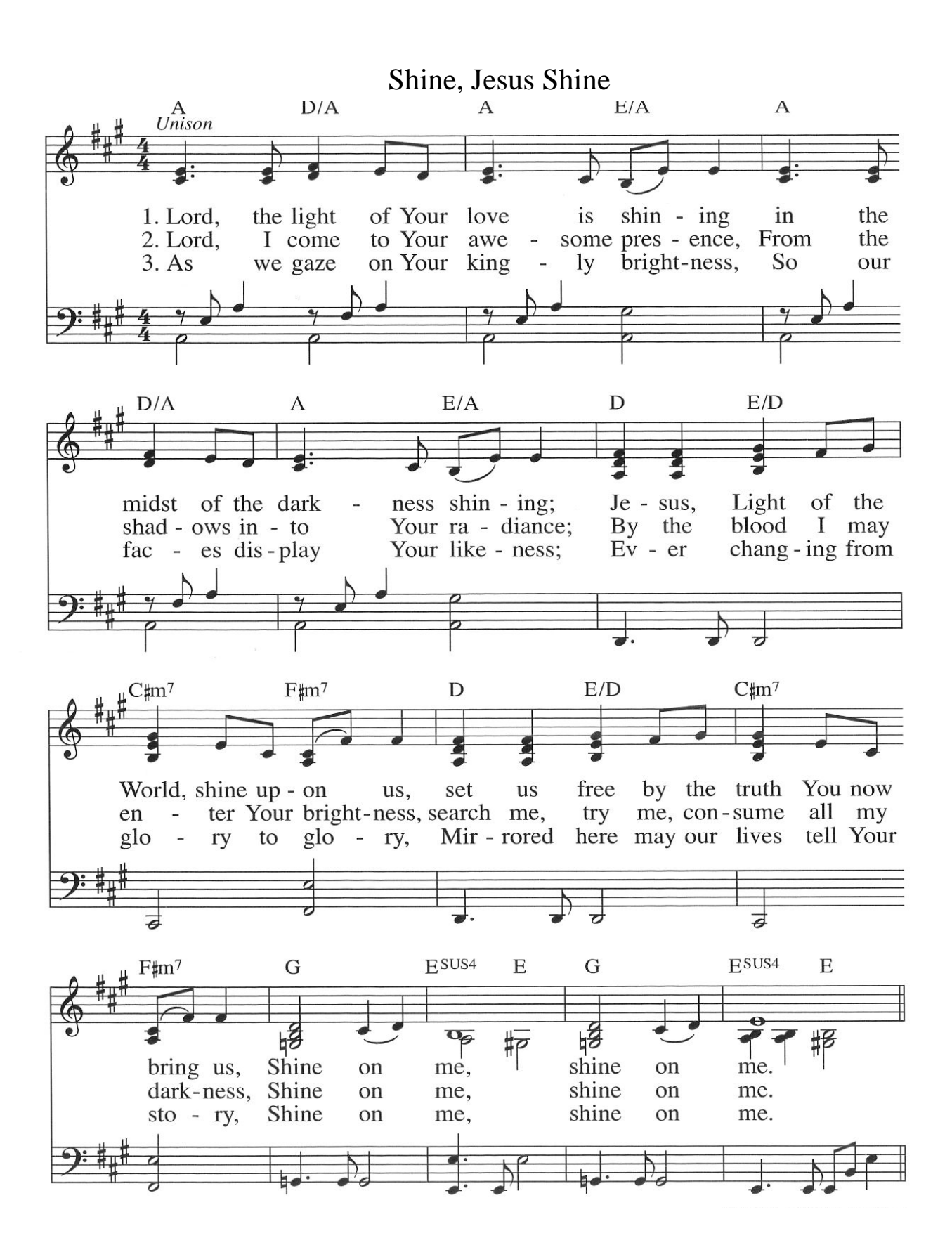
Shine, Jesus Shine" Graham Kendrick © 1987 Make Way Music All rights reserved. License #A700343